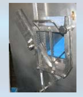
Random cut knife set