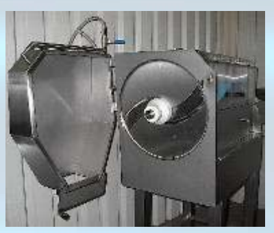
Adjustable disc 1-24 mm