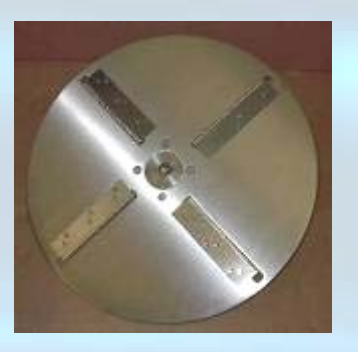
Crinkle cut disc