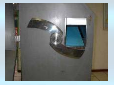
2 wing knife