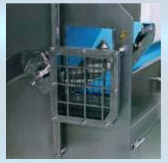
Dicing set 12 or 20 mm