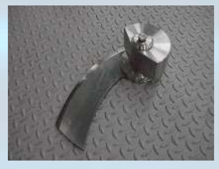
1 wing knife Stripping disc 2, 3 or 4 mm